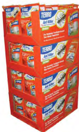
T925-FD Ant Killer Plus Quarter Pallet Display