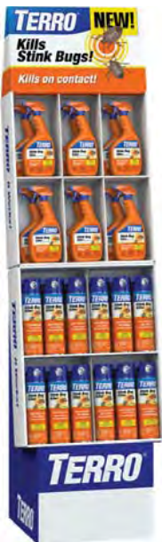
T3550-FD Stink Bug Killer Combination Floor Display

24 eaches - T2302-6 Spider Killer 3 Spray 48 eaches - T3200 Spider & Insect Traps