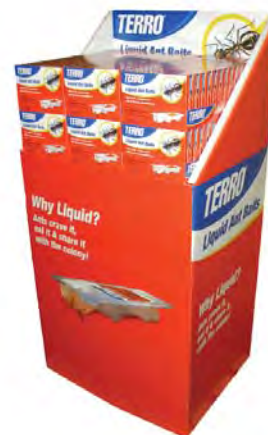
T325-FD Ant Killer 1 Liquid Ant Baits Quarter Pallet Display