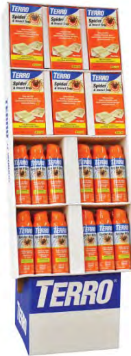
T2375-FD Spider Killer 3 Combination Floor Display

24 eaches - T2302-6 Spider Killer 3 Spray 48 eaches - T3200 Spider & Insect Traps