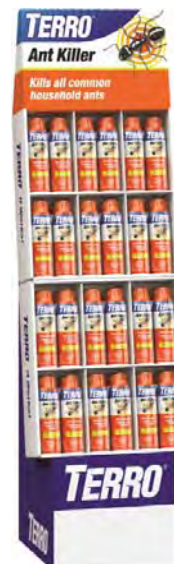
T401-FD Ant Killer Spray 2 Floor Display