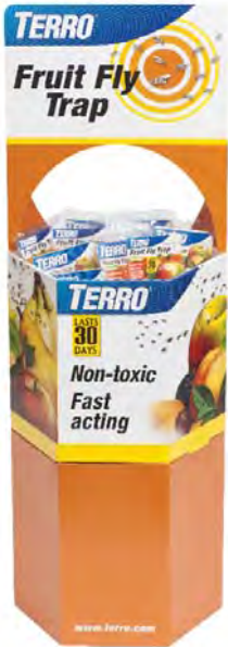
T2500-FD48 Fruit Fly Floor Display 48 eaches - .50 fl. oz.