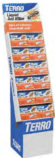
T300-FD Ant Killer 1 Liquid Ant Baits Floor Display