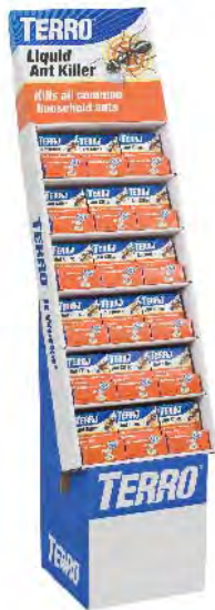
T100-FD Ant Killer 1 Floor Display