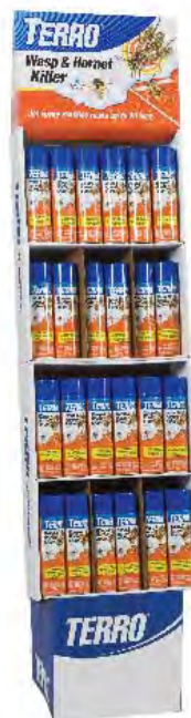
T3300-FD Wasp & Hornet Killer Floor Display

24 ea - T3500-6 Stink Bug Killer (Aerosol) 12 ea - T3600-6 Stink Bug Killer (RTU)