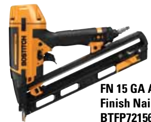
FN 15 GA Angled Finish Nailer BTFP72156