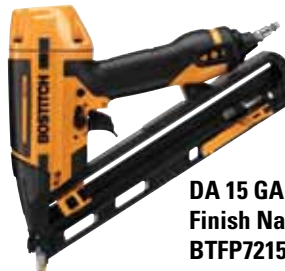
DA 15 GA Angled Finish Nailer BTFP72155