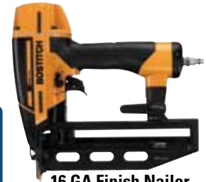
16 GA Finish Nailer BTFP71917