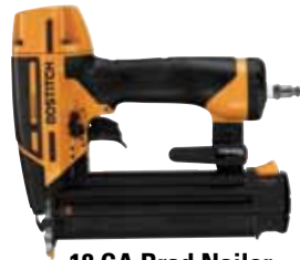
18 GA Brad Nailer BTFP12233