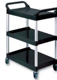
Utility Service Cart