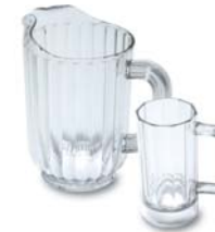
Bouncer® Pitchers & Mugs