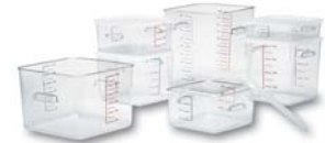
Square Space Saving Containers