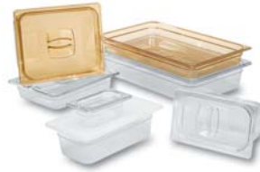
Cold & Hot Food Pans