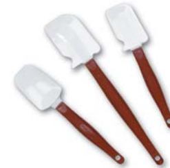
High Heat Scraper & Spatulas