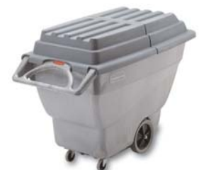
Structural Foam Tilt Truck & Lid