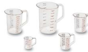
Bouncer® Measuring Cups