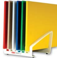
Color Coded Cutting Board System