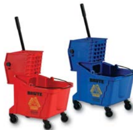
Color Coded Mopping Combo Pack