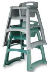
Sturdy Chair™ Youth Seats