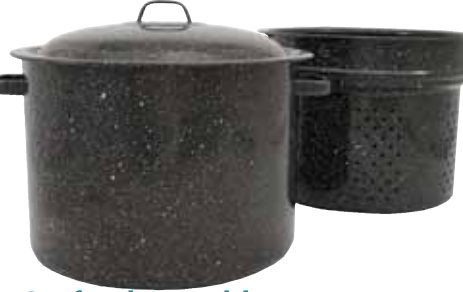
Seafood Pot with Steamer/Drainer Insert

Features fired on lobster decal. F6190 19 Quart Black