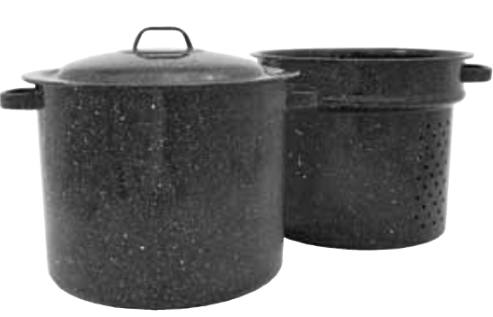
Pasta Pot with Drainer Insert 7 1/3 Quart F6141 Black