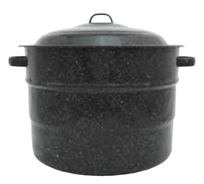
Canner with Jar Rack Rack holds 7 one quart jars. Jars not included F0707 21 ½ Quart Black