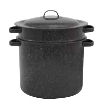
Blancher with Drainer Insert F6140 7 ½ Quart Black