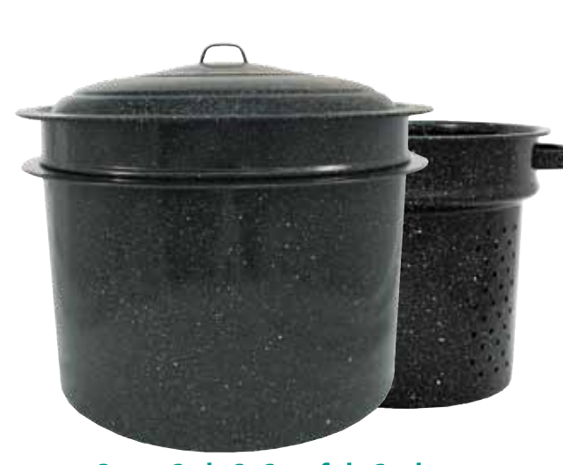
3 pc. Crab & Crawfish Cooker

Includes large capacity cooker, drainer insert and lid.