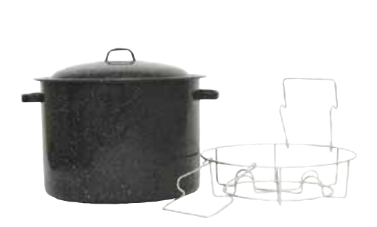
Mini Canner with Jar Rack Just right for jams, jellies and salsa. Rack holds 7 one pint jars. Jars not included F0706 11 ½ Quart Black