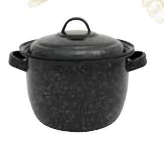
Bean Pot F6129 4 Quart Black

Granite•Ware has a carbon steel core for strength, conductivity and heat distribution. Porcelain is fused to the steel at 2,000°F producing a non-porous, inert glass surface this is naturally nonstick. Granite•Ware is as Green as you can get! There are no PTFE's, PFOA's or any other chemicals to change the taste, color or nutritional value of food.