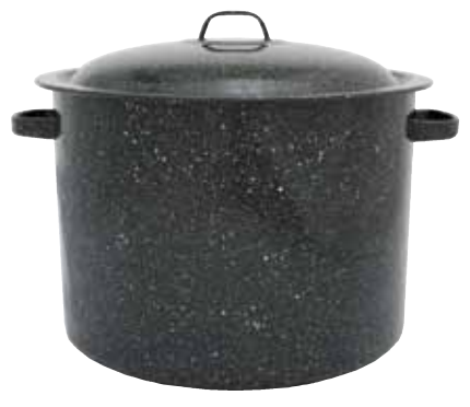
Soup Pots F6135 11 ½ Quart Black Display Available