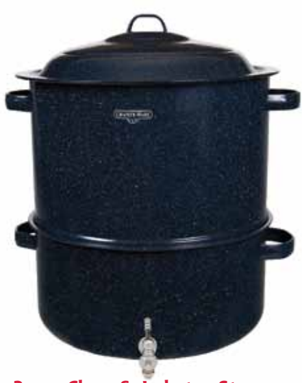
3 pc. Clam & Lobster Steamer

Includes pan, broiler/grill pan and grill rack. F0803 14" x 9" x 2" Midnight Blue