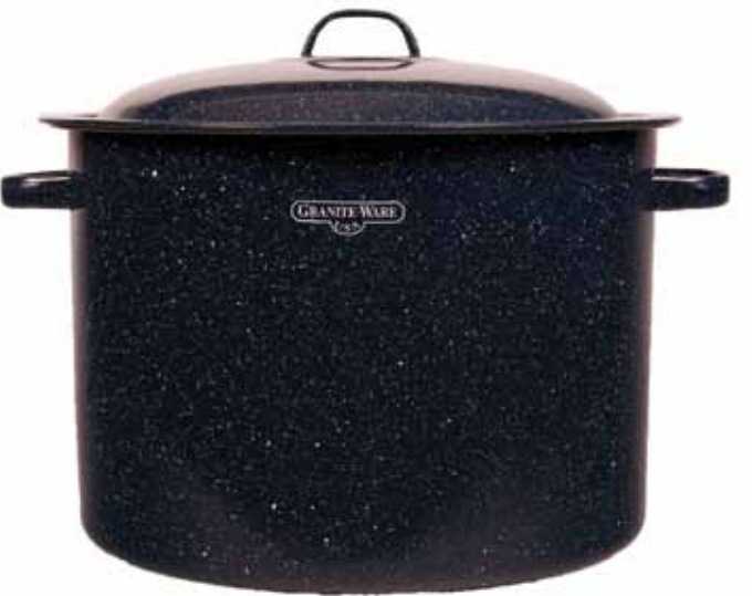
Canner with Jar Rack

Rack holds 7 one quart jars. Jars not included F0810 21 ½ Quart Midnight Blue