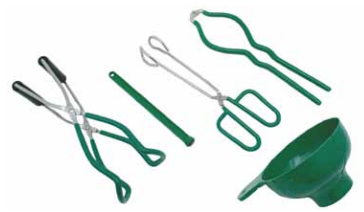
5 pc. Canning Set Set includes; Jar Lifter, Magnetic Lid Lifter, Kitchen Tongs, Jar Wrench and Jar Funnel. F0717 5 pc. Set