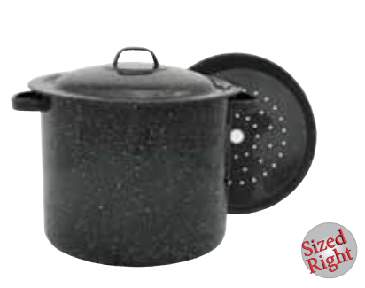
Stockpot with Steamer Insert F6209 4 Quart Black