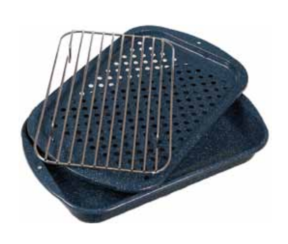
3 pc. Bake, Broil & Grill Set

Includes pan, broiler/grill pan and grill rack. F0803 14" x 9" x 2" Midnight Blue