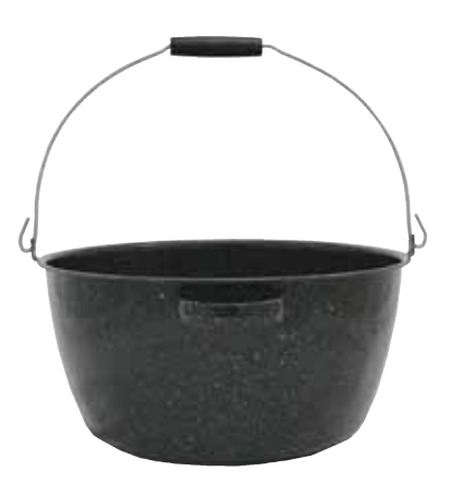
Preserving Kettle with Handle F0704 16 Quart Black