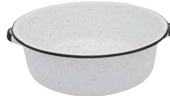
Dish Pan with Handles

F6415 15 Quart Blue F6416 15 Quart White