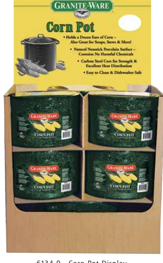
6134-9 Corn Pot Display