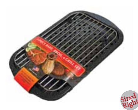
3 pc. Bake, Broil & Grill Set

Includes pan, broiler/grill pan and grill rack.