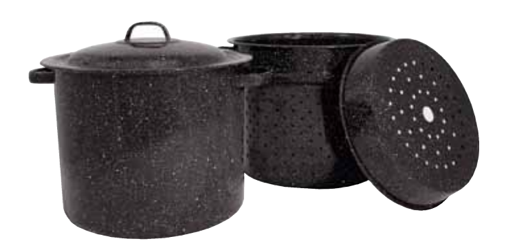
4 pc. Multi-Pot Set

Includes stockpot, lid, pasta/drainer insert and steamer insert. For cooking, steaming and blanching. Black F6145 7 ½ Quart