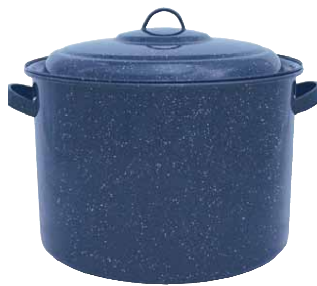
Tamale/Stockpot Without insert