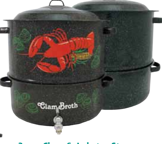
3 pc. Clam & Lobster Steamer

Includes boiler, steamer insert and lid.