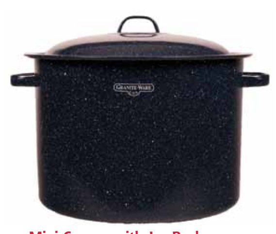
Mini Canner with Jar Rack

Rack holds 7 one pint jars. Jars not included