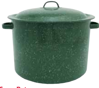
Corn Pot Holds a dozen ears of corn. F6132 11 ½ Quart Green Display Available (shown)