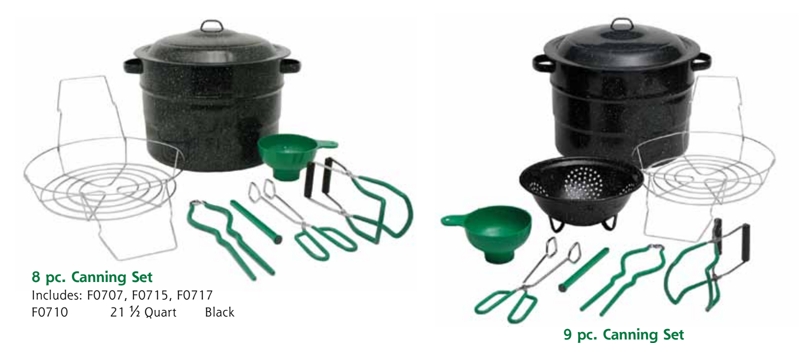
12 pc. Canning Set

Includes: F0707, F0715, F0717, F0713 F0718 21 ½ Quart Black