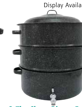
3 Tier Shore Dinner Pot

F6315 15 ½ Quart Black Display Available (shown)