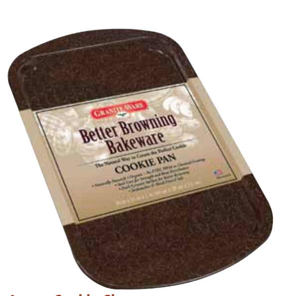
Large Cookie Sheet