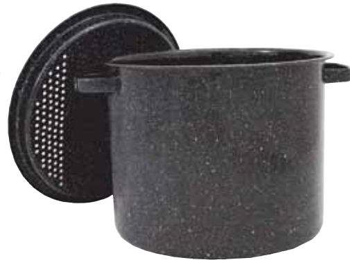
Pasta Pot with Strainer Lid Strainer lid for safely draining pasta, potatoes & vegetables. 8 Quart F6144 Black