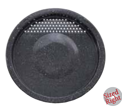
Strainer Lid Built-in strainer on lid. Fits 0613, 6137, 6140 & 6172 pots. F2013 9.6" Dia. Black

Includes stockpot, lid, pasta/drainer insert and steamer insert. For cooking, steaming and blanching. Black F6145 7 ½ Quart