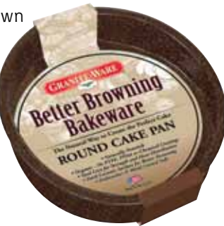
Round Cake Pan