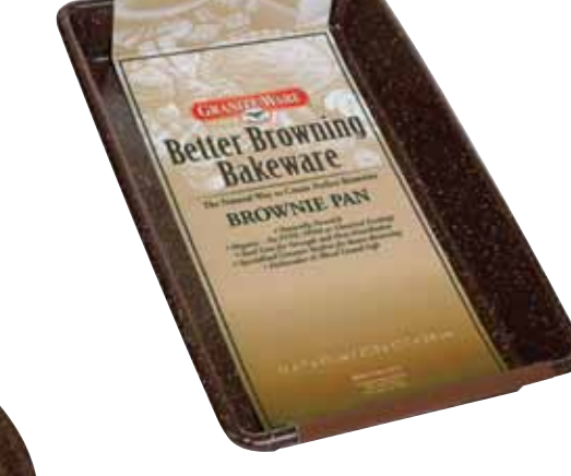
Rectangle Cake Pan F0620 11" x 7" x 1 ½" Brown