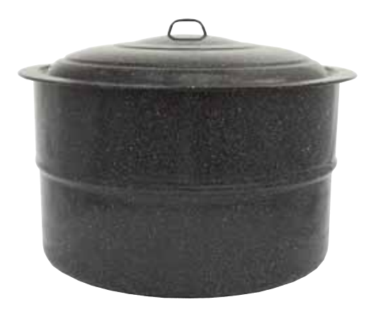
Canner with Jar Rack Great for preserving tomatoes and fruit. Rack holds 9 one quart jars. Jars not included F0709 33 Quart Black