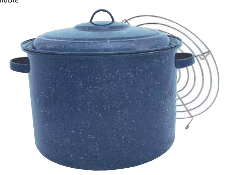
Tamale Pot with Insert 21 Quart Blue F6723