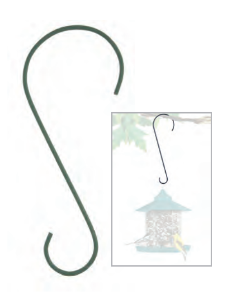
67 - 12" METAL HOOK 68 - 23" METAL HOOK