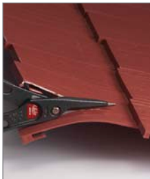
HEAVY VINYL SIDING

Lightweight 12-inch (31 cm) aluminum handled combination snip, features a BIG 3" (76 mm) cutting depth. Inset steel blades feature a Knife like edge that produces a smooth slicing action for cutting thick or layered vinyl and a variety of other flexible non-ferrous materials.