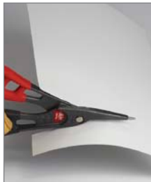
ALUMINUM TRIM COIL