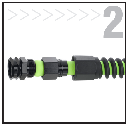
Slide bend restrictor and fitting nut onto hose. Push the threaded fitting into hose until flush.