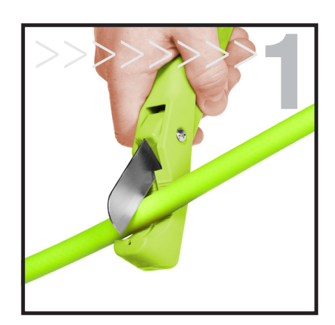
Measure and cut desired length of hose at 90°.