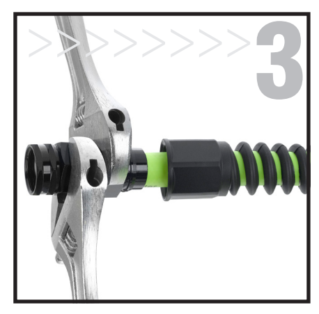
Tighten fitting nut until snug. Snap into bend restrictor.