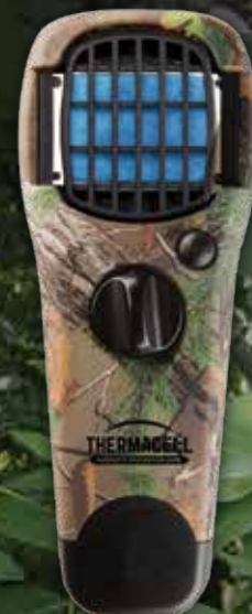
REALTREE™ XTRA GREEN REPELLER | MR-TJ