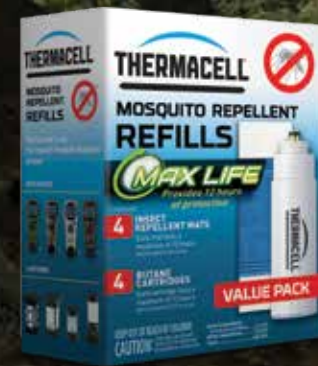
MAX LIFE MAT | L-4