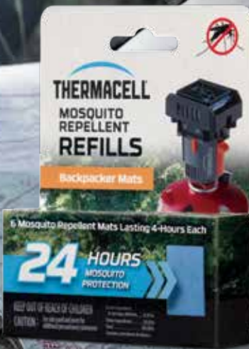
BACKPACKER REFILL | M-24