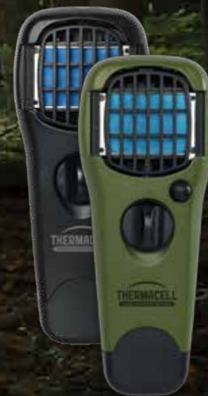
BLACK REPELLER | MR-LJ