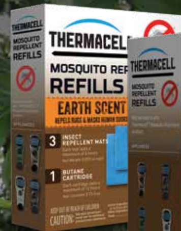
EARTH SCENT REFILL PACK E-1 | E-4