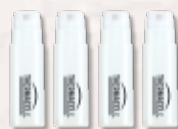
4 BUTANE CARTRIDGES LASTING 12 HOURS EACH