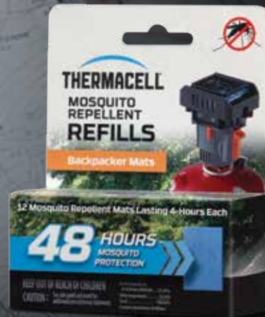
BACKPACKER REFILL | M-48