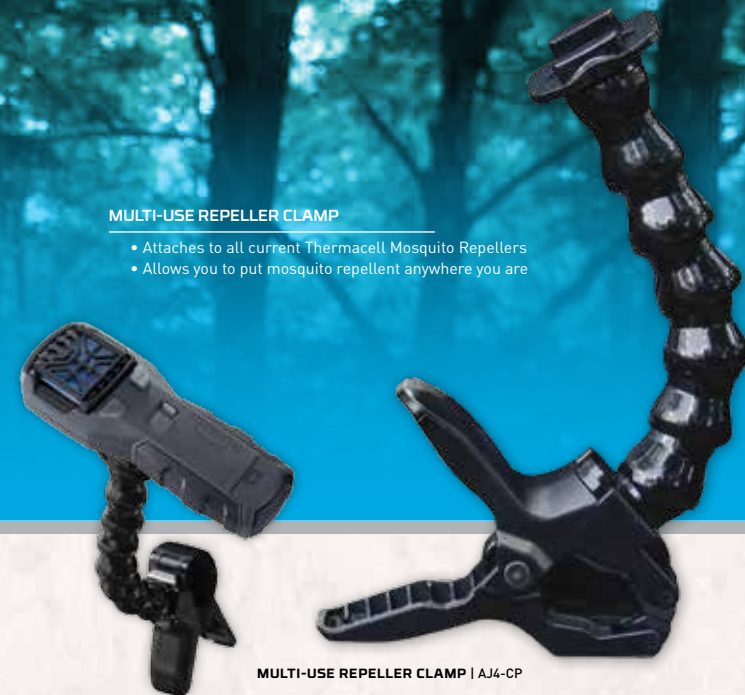
MULTI-USE REPELLER CLAMP | AJ4-CP