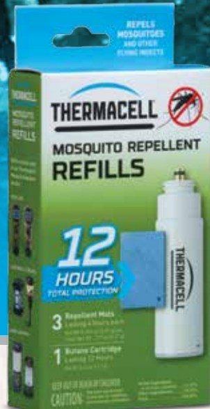
SINGLE REFILL PACK | R1