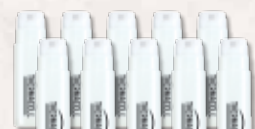
10 BUTANE CARTRIDGES LASTING 12 HOURS EACH