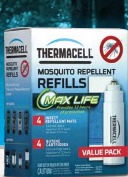
MAX LIFE REFILL PACK | L4