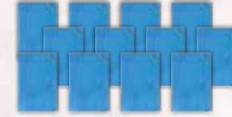
12 MOSQUITO REPELLENT MATS LASTING 4 HOURS EACH