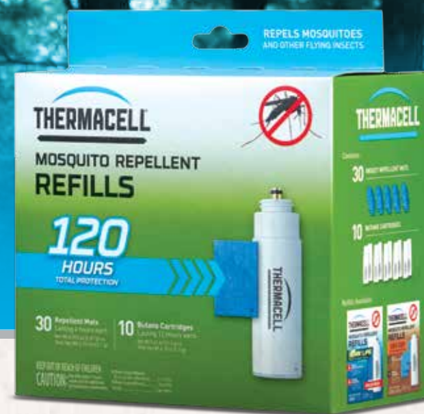
MEGA REFILL PACK | R10