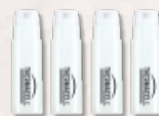
4 BUTANE CARTRIDGES LASTING 12 HOURS EACH