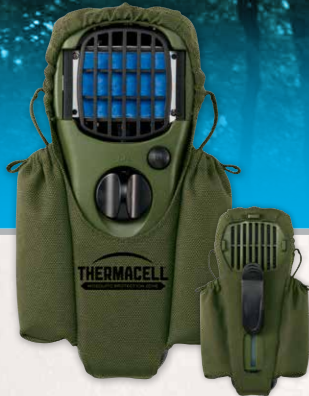
HOLSTER WITH CLIP OLIVE | MR-HJ