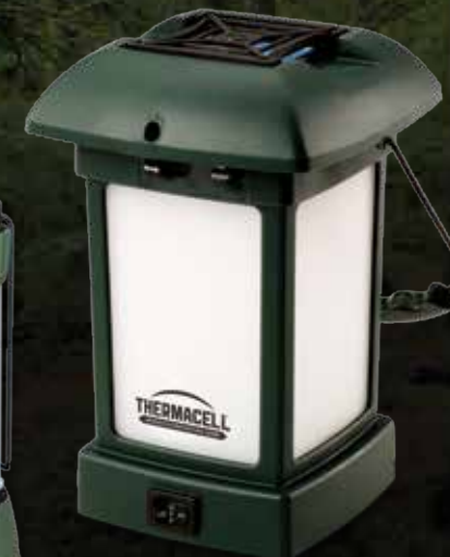
OUTDOOR LANTERN | MR-9L