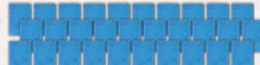
30 MOSQUITO REPELLENT MATS LASTING 4 HOURS EACH