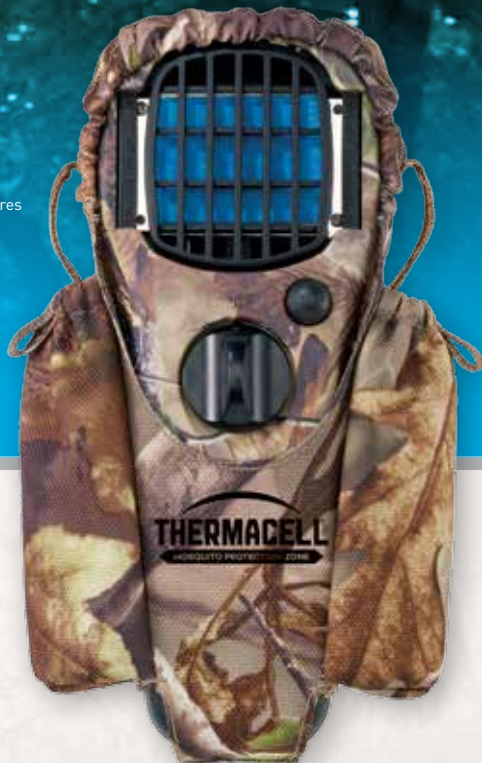
HOLSTER WITH CLIP REALTREE | MR-HTJ