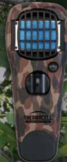
WOODLANDS CAMO REPELLER | MR-FJ