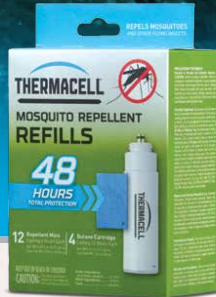
VALUE REFILL PACK | R4