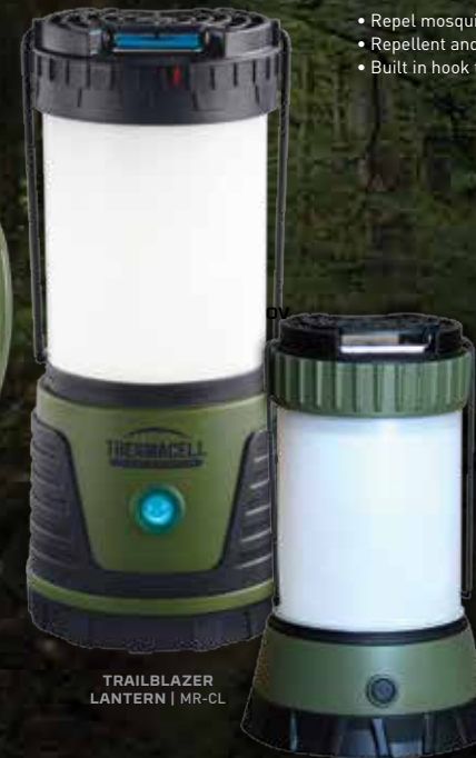
TRAILBLAZER LANTERN | MR-CL