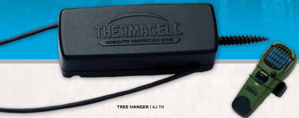
TREE HANGER | AJ-TH