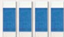
4 MAX LIFE MATS LASTING 12 HOURS EACH