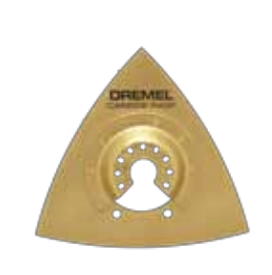
Carbide Rasp MM920 Thinset, cement mortar, plaster and wood.