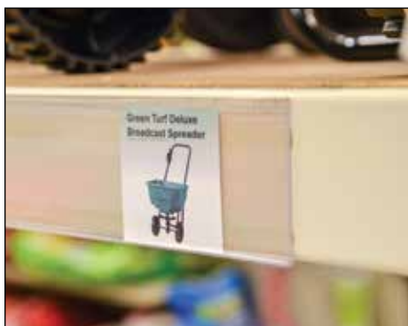
3"H x 47.625" width RDBTT3047E-C

Additional volume discounts available. Call for pricing.